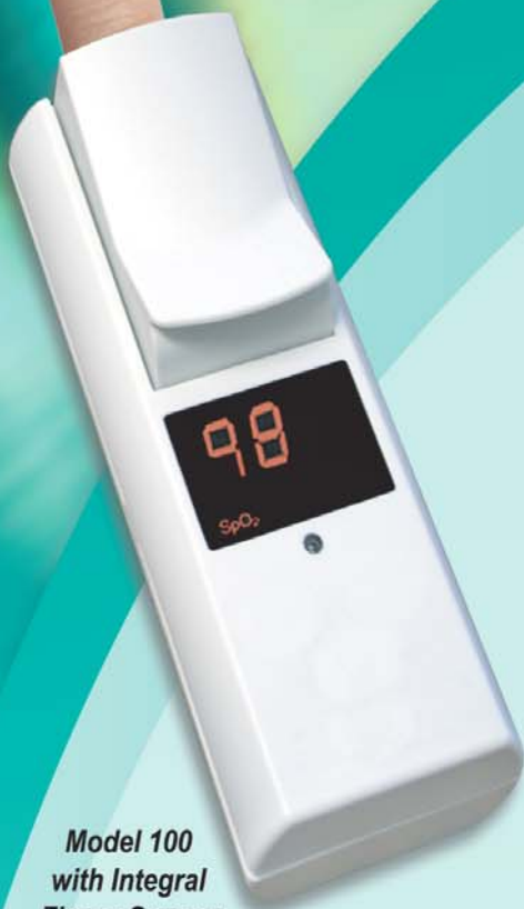
Model 100 with Integral Finger Sensor