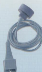
Disposable probe PD100