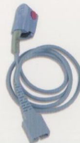
Child probe PC100