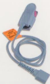
Adult probe PA100