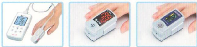
Palpus Handheld SA 210