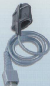
Tube probe PF100